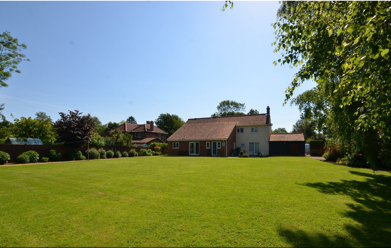
Norwich Road, Norwich, NR16 Five Bedroom Detached House - Guide £540,000